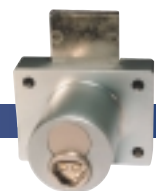
Cabinet lock with IC cylinder