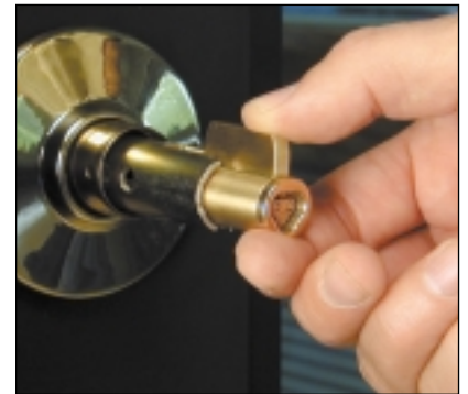
Insert CyberLock cylinder