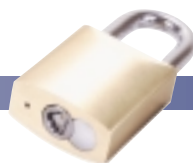
Padlock with 6-pin cylinder