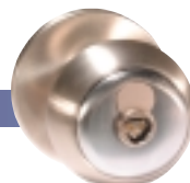
Knob with IC cylinder