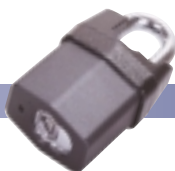
High-security padlock with 6-pin cylinder