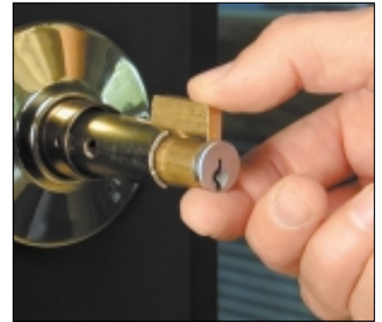
Remove mechanical lock cylinder

CyberAudit software also provides high-security features. A lock can be set to require more than one authorized key before it will open. A list of lost keys can be stored in each cylinder for when a key is missing or stolen, eliminating re-keying. A reset key allows you to electronically reset the passwords in your locks and keys if the security of your system is compromised. And, you can define expiration dates for each key for additional key control or to provide temporary access.