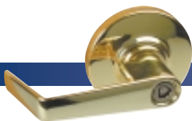
Lever with 6-pin cylinder